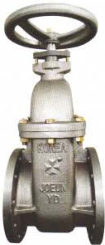
KOREA KS B 2350 KCW-2014-0187