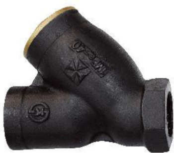
KS B 1538